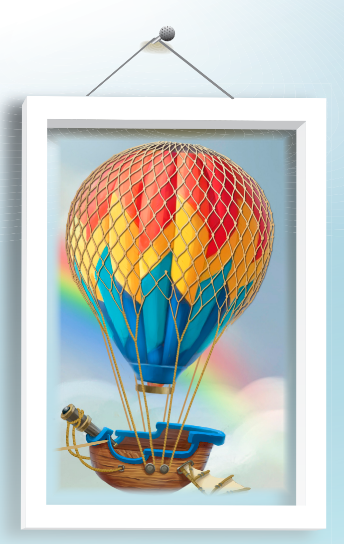
WHEN YOU FEEL DOWN REMEMBER THIS: THE SUN IS ALWAYS SHINING ABOVE THE CLOUDS'.